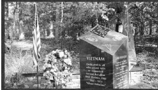
Vietnam Veterans of 2D Bn 1st Marines Reunion Arlington VA 2021 November 10th - 15th