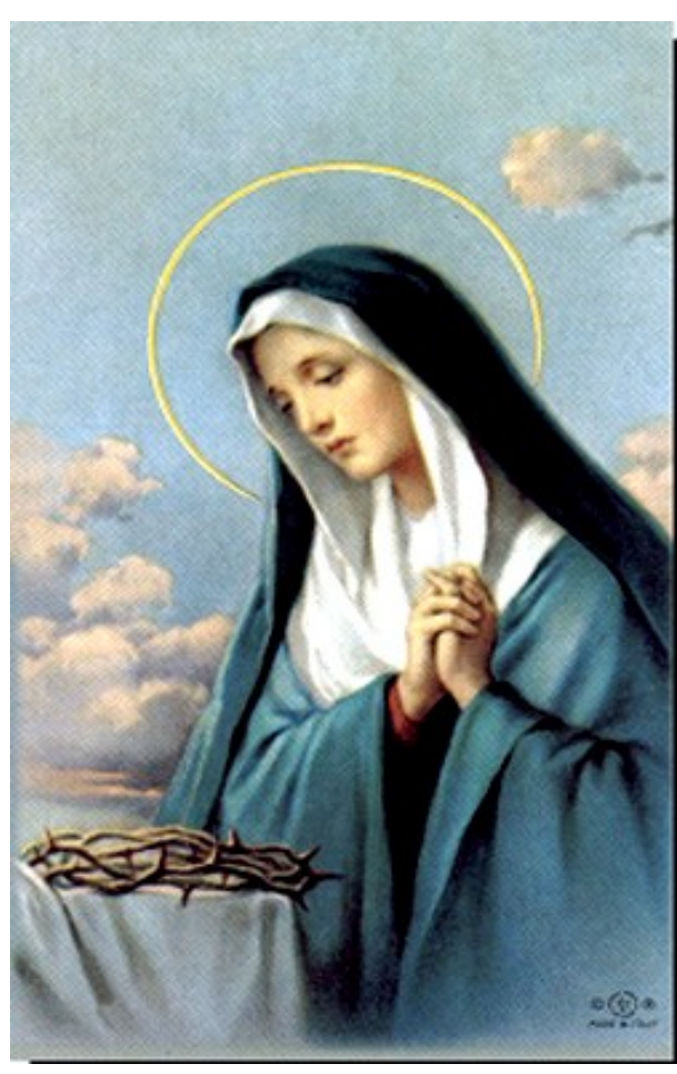
Our Lady of Sorrows