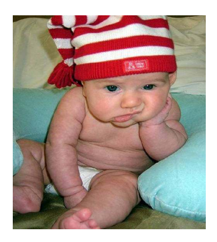
What the hell happens now?