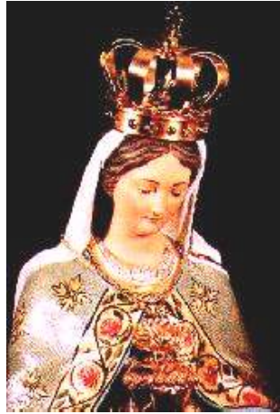
Our Lady of the Rosary - Prouille, France (1208)

Domingo de Guzman was a Spanish preacher who went to southern France to oppose the Albigesian heresy which was spreading rapidly. In 1208, while he was praying at a chapel in Prouille, Mary appeared to him and gave him the Rosary and urged him to preach the Rosary to all people as a remedy against heresy and sin. The factual basis for this series of events is questionable. Nonetheless, Domingo (Dominic) founded an order of preaching friars who went on to halt the Albigesian heresy and establish monasteries all over the world. The order is commonly referred to as the Dominicans.