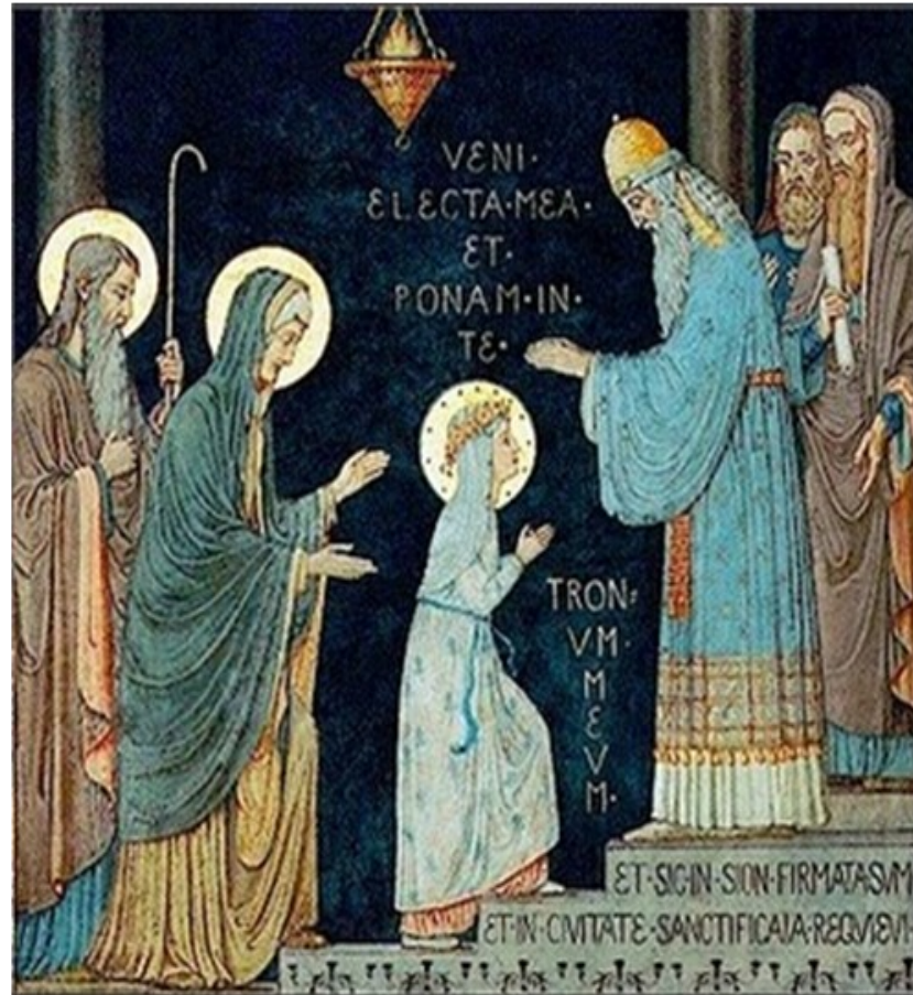
“The Presentation of Mary”