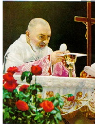
Saint Padre Pio Pray for us.