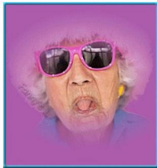
Here is a message for PP.