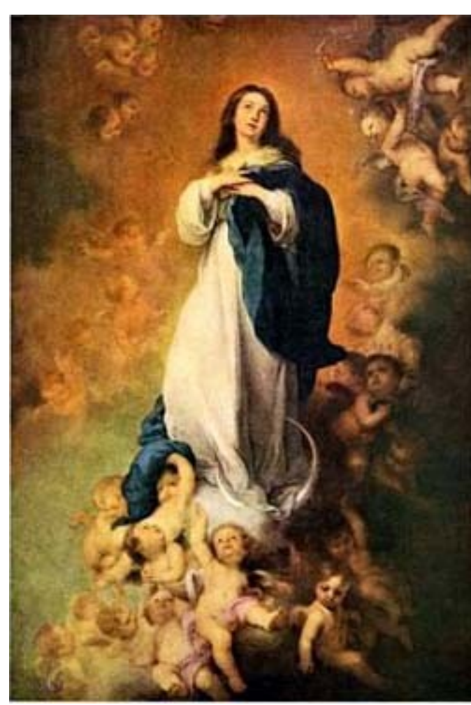
Assumption of Mary-August 15