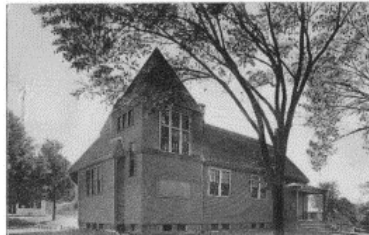
Postcard History Series, Hingham, n.d., p.28.

Route 228, by Fire Headquarters with the cannon out front.