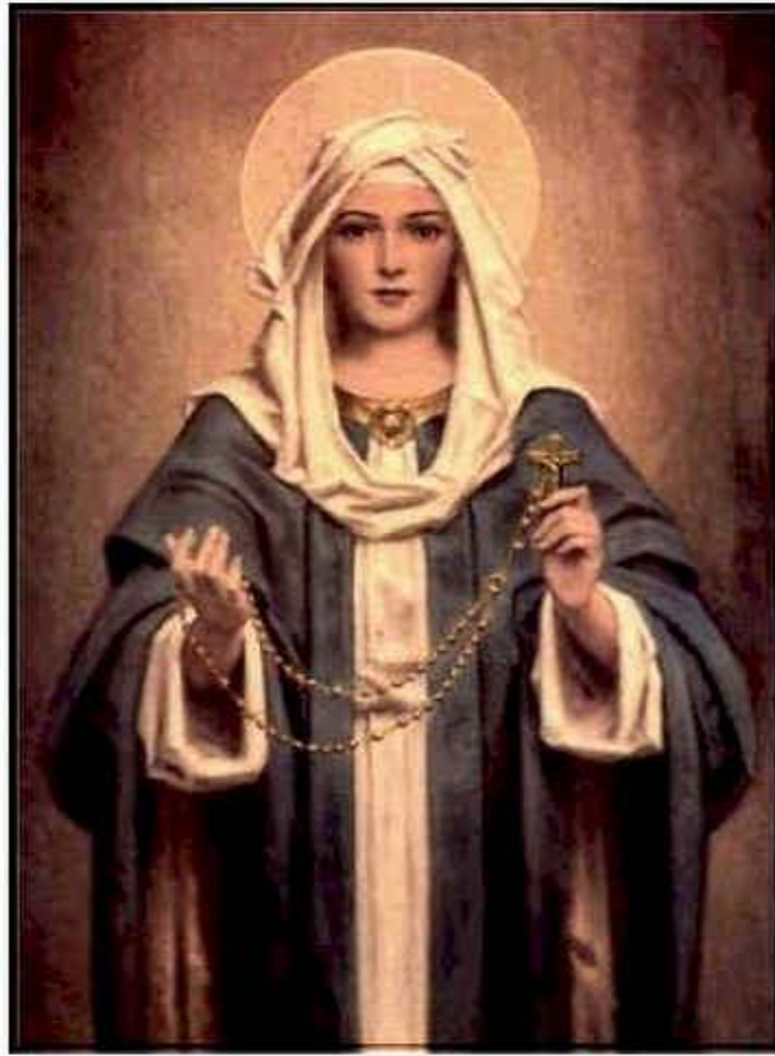
Our Lady of The Rosary