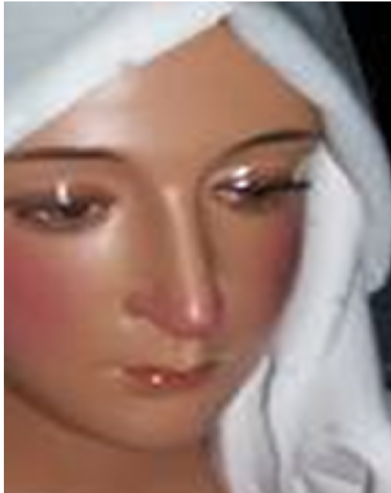
Our Lady of The Assumption