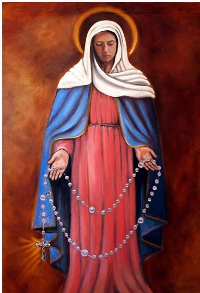
Our Lady of the Rosary