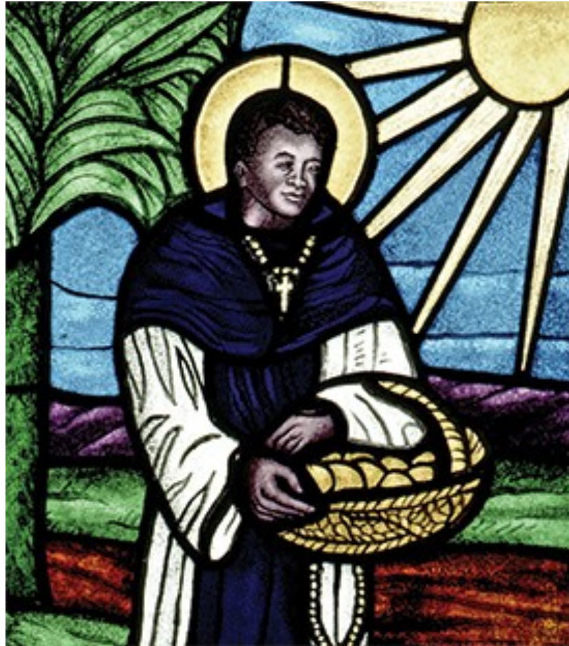
St. Martin de Porres